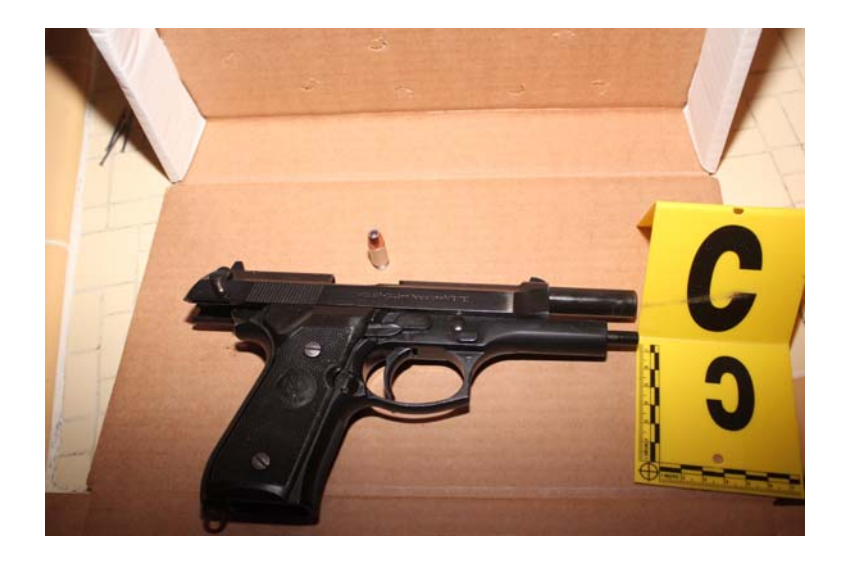
The 9mm Beretta 92F semi-automatic pistol after it had been collected as evidence.

The 9mm Beretta 92F semi-automatic pistol recovered from a shelf in the kitchen of 340 South H Street was test-fired and determined to be in proper working order.