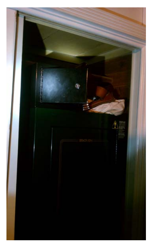
Large green safe and small unlocked safe

Inside the residence there were numerous firearms accessories, ammunition paraphernalia, various hunting and/or weapons related periodicals, and paperwork located in the northeast master bedroom. A large green rifle safe and a smaller unlocked and opened gun safe were located in the main hall closet.