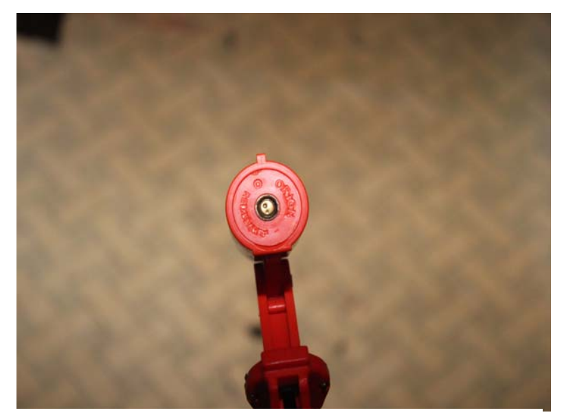
The two firing pin marks on the primer to the shell found in the Orion flare gun after it had been collected as evidence